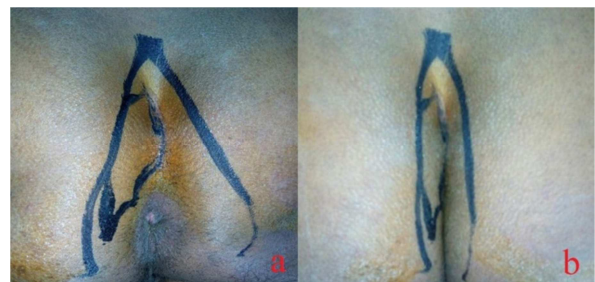
a: Buttocks pulled apart b: Buttocks in normal position

The procedure was carried out under spinal anesthesia, in jack knife position, fifteen patients request general anesthesia. Shaving of sacrococcygeal region extended to periphery of the thigh on both sides was done, then cleaning the area with Povidone Iodine 7.5%. The buttocks pushed together before surgery and the contact area between buttocks was marked ( Figure 1 ).