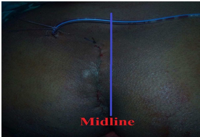
Figure 3. Skin closure after cleft lift procedure and releasing of right skin flap. (The Wound is to the left of midline and not under tension).

Asymmetrical excision created a flap, which is pulled past the natal cleft to the contralateral side. Skin flap is freed from the right side and advanced across the midline to be sutured to the other, and suction drain was fixed under subcutaneous tissues. Subcutaneous tissue were closed with sutures with Vicryl 3/0, skin was closed by interrupted 3/0 Prolene sutures or subcuticular Vicryl 3/0 in some cases ( Figure 3 ).